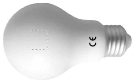
4. BACK TRANSFER