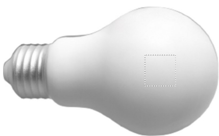
3. FRONT TRANSFER