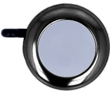
2. TOP OTHER